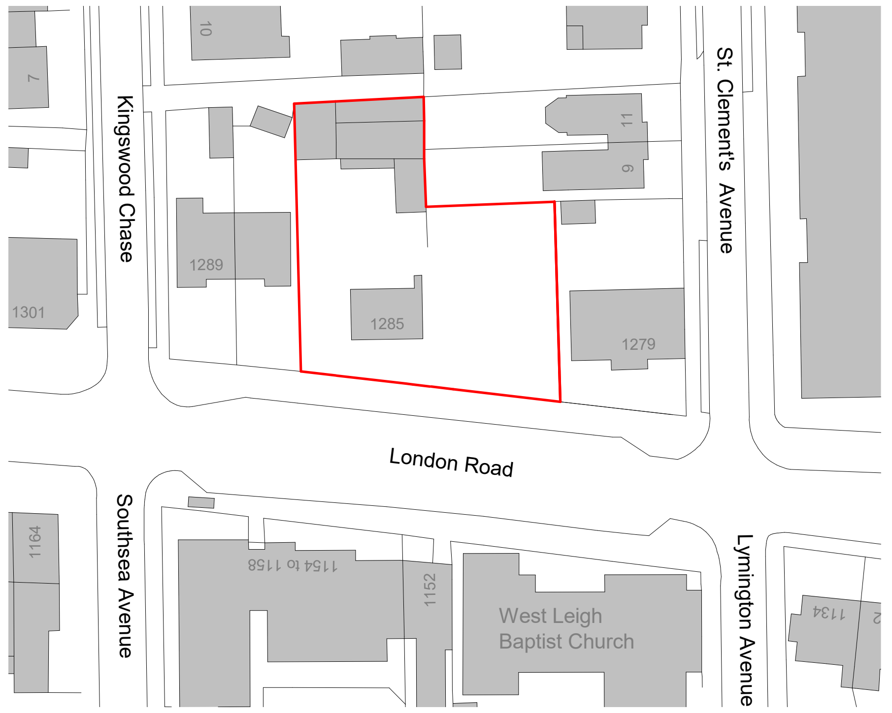
2 Block Plan 1 : 500